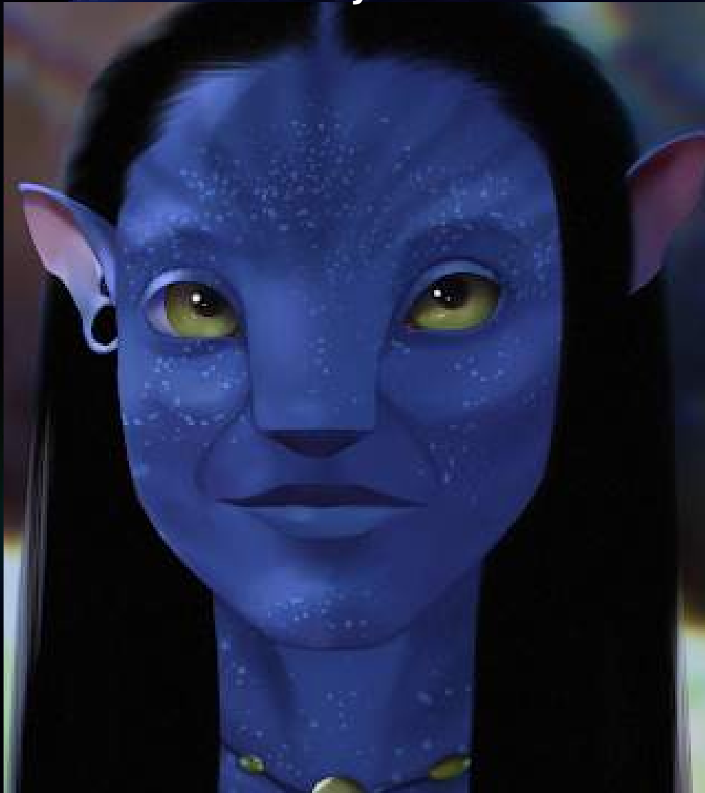
Co-Founder and Blockchain Developer