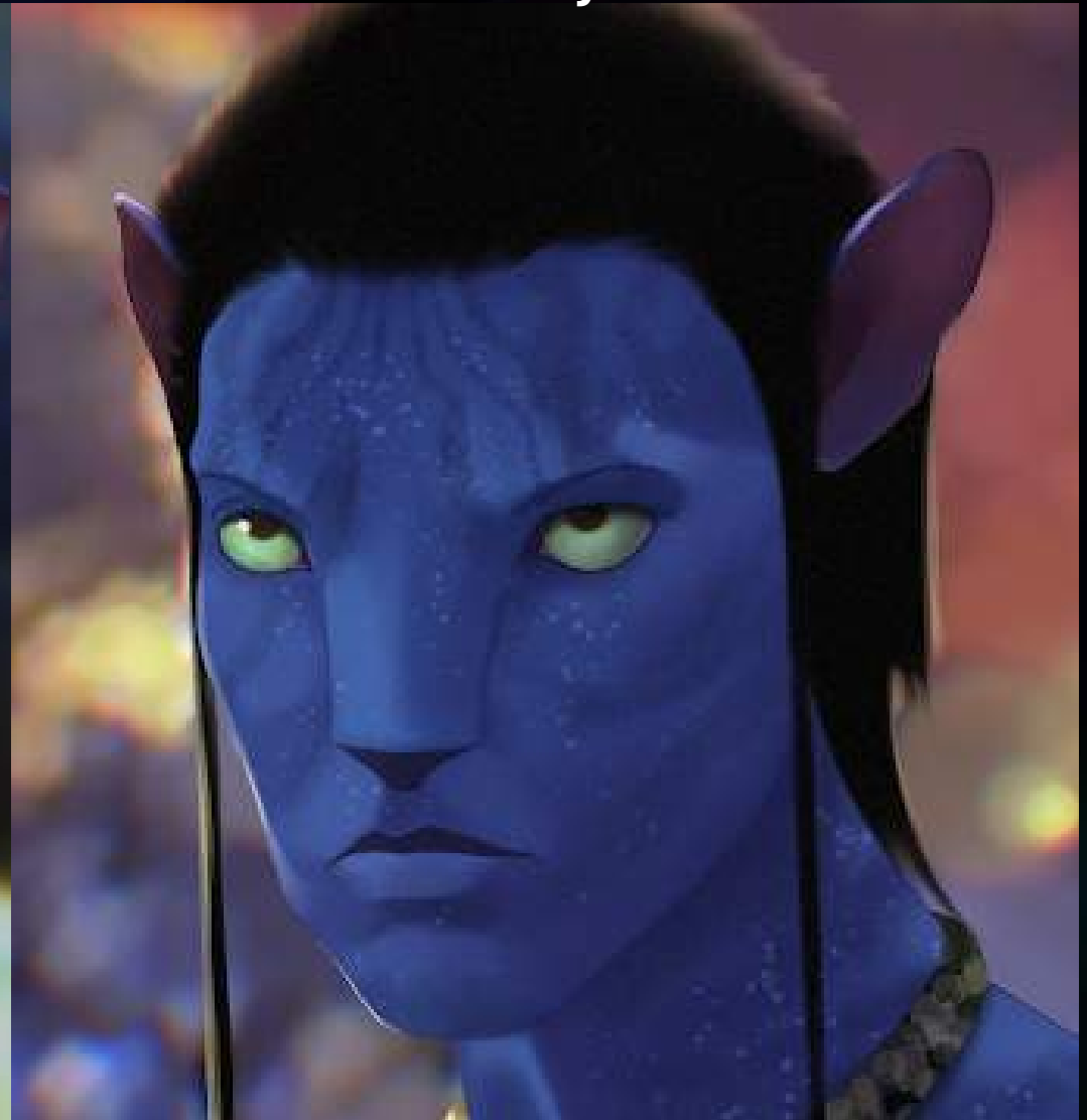
Co-Founder Game Developer